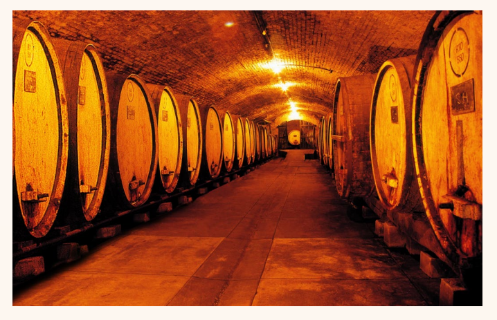
Day 4 - Nagambie - Thursday 22nd November 2018

This morning after breakfast we visit the historic Tahbilk Winery then on to Mitchelton Winery and The Ministry of Chocolate. Experience wine tasting (own expense), the underground wine cellars and the stunning views from Mitchelton's "Ashton Tower". On our return to Nagambie take a walk along the lake boardwalk, visit the parkland or take a stroll up the main street (High Street). Our coach will pick us up for dinner and take us to the historic Royal Mail Hotel commonly known as "The Top Pub".