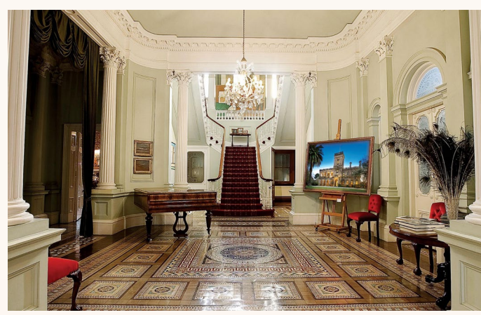
Day 3 - Melbourne - Nagambie - Wednesday 21st November 2018

We rise for an early breakfast and board the coach for Nagambie located in the Goulburn River Valley (the Heart of Victoria). After lunch we visit Noorilim Estate (an historic mansion, gardens and vineyard dating back to 1879) for a guided tour of the homestead and garden. This afternoon check in to our accommodation for a 2 night stay at the Nagambie Waterfront Motel. Later that evening dress up (smart casual dress) for Pre-Dinner Drinks (included) followed by Dinner.