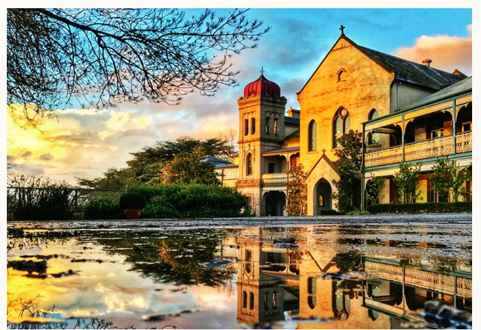
Day 5 - Nagambie - Ballarat - Friday 23rd November 2018

Our coach departs Nagambie after an early breakfast to make our way to Ballarat. On the way we visit Hepburn Springs, where we can enjoy morning tea, take a walk to sample the different mineral water from the natural springs or you may like to choose from the different therapeutic bathing options that Hepburn Springs has to offer. We will then travel on to Daylesford for lunch at the historic Convent Gallery. From there we make our way to Ballarat for our stay at Craig's Royal Hotel. Free time to relax before our mystery dinner.