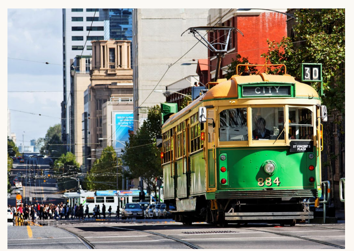
Day 2 - Melbourne - Tuesday 20th November 2018

After breakfast we meet in the hotel foyer and take the tram to Flinders Station and board the City Circle Tram to view the highlights of the city. On our return we visit the infamous Lygon Street for a delicious treat. You could make this morning tea or lunch, whichever you desire. Browse the many shops and make your own way back by tram to the hotel to prepare for dinner on the Colonial Tramcar Restaurant (Smart casual dress – no jeans please). After dinner if you wish, visit the Crown Entertainment Complex for a nightcap or head back to the hotel for an early night.