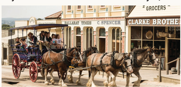
Day 6 - Ballarat - Melbourne - Saturday 24th November 2018

Today we will explore Sovereign Hill and sample "life 1850's style". Late afternoon we make our way back to Melbourne for our 3 night stay at the Mercure Hotel Welcome or the Swanston Hotel Grand Mercure. After check-in the remainder of the evening sees you at your leisure. For those who would like to experience Lygon Street for dinner, catch the tram from the Hotel's front door. Others may like to dine locally