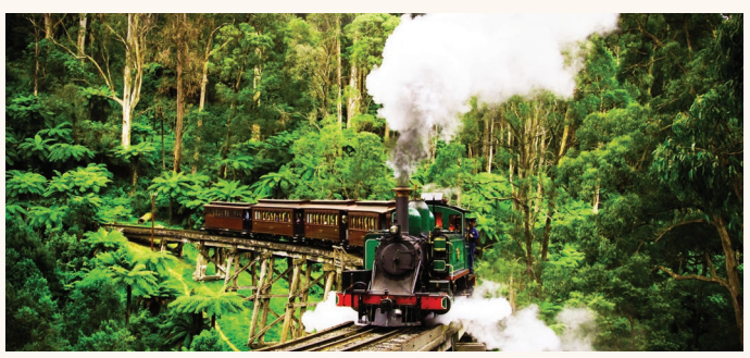
Day 8 - Yarra Valley - Monday 26th November 2018

After an early breakfast we will join a special private group tour to ride the Puffing Billy and then tour the Yarra Valley and Vineyards. On our return to the Hotel get together with our fellow travellers in the Cocoon Bar for a farewell drink (included) before dinner. Dinner is at your own leisure to allow you to choose your preferred cuisine or newly found favourite restaurant.