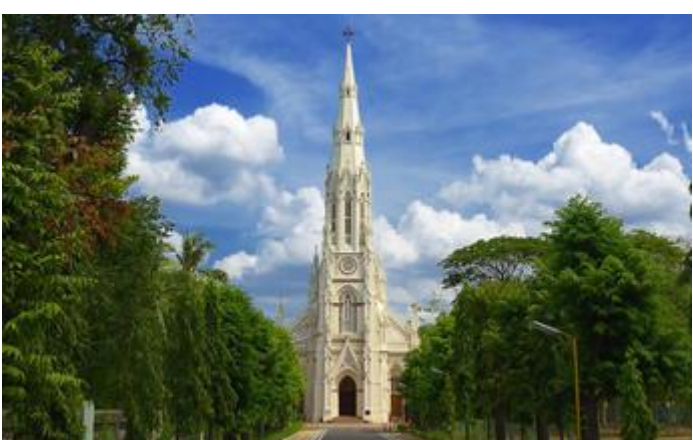
Day 3: Palais de Mahe, Puducherry (Sat, 9 March)