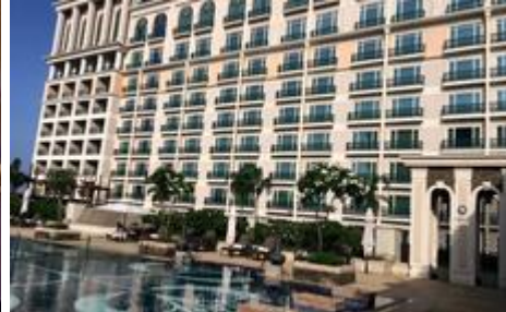
Day 2: The Leela Palace Chennai, Chennai (Fri, 8 March)