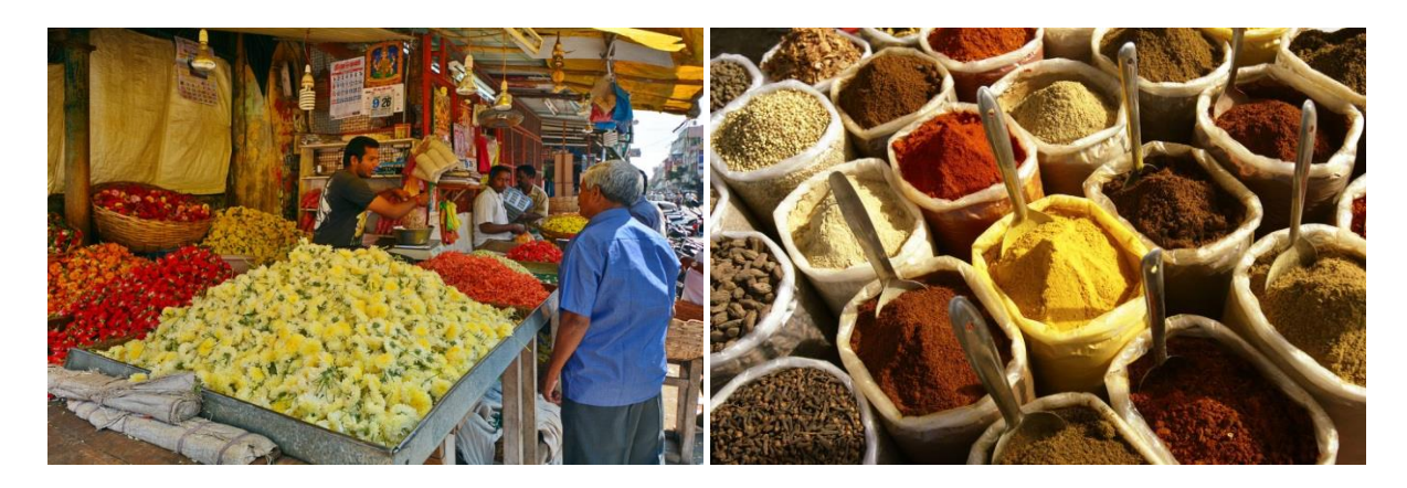
Day 5: Palais de Mahe, Puducherry (Mon, 11 March)