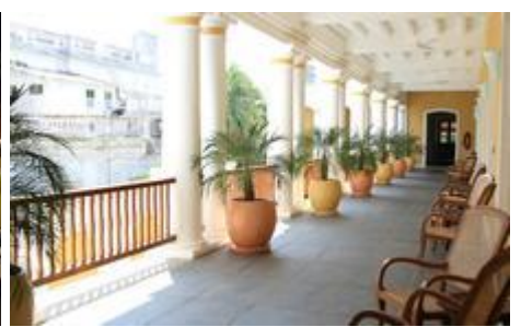
Day 4: Palais de Mahe, Puducherry (Sun, 10 March)