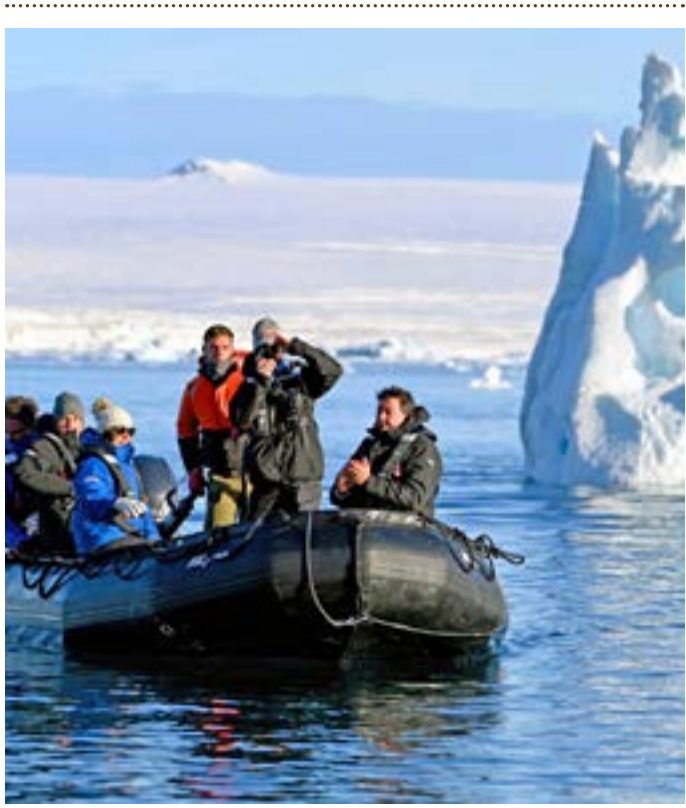
Zodiac excursion, Antarctic Peninsula

X 13 Day Cruise Suenos Aires Buenos Aires Buenos Aires