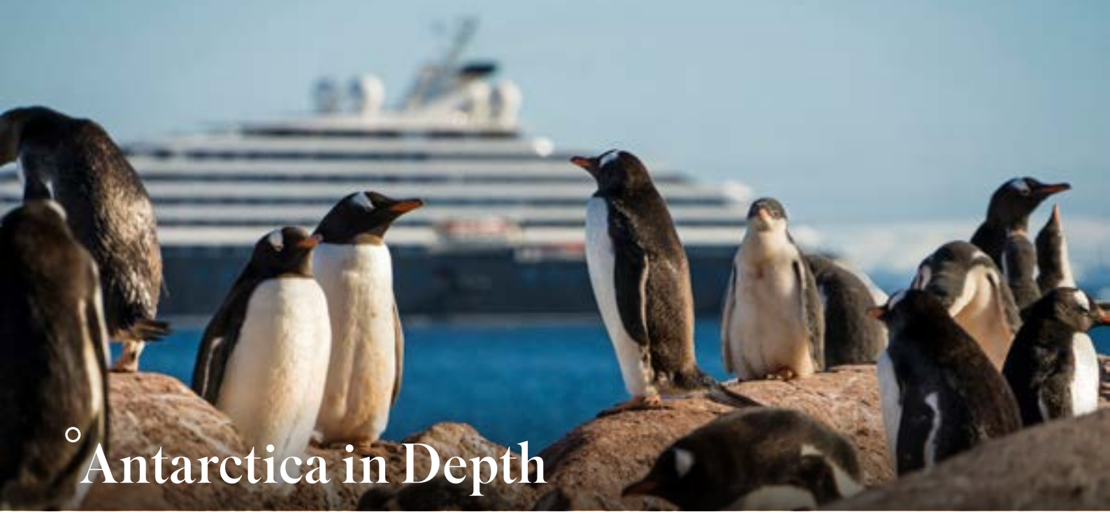
Scenic Eclipse and Gentoo penguins, Antarctica